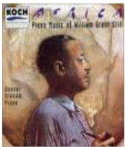
William Grant Still